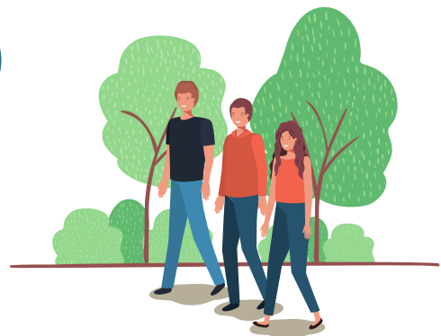
Overdose Survivor & Post Overdose Outreach Team in Alternate Setting