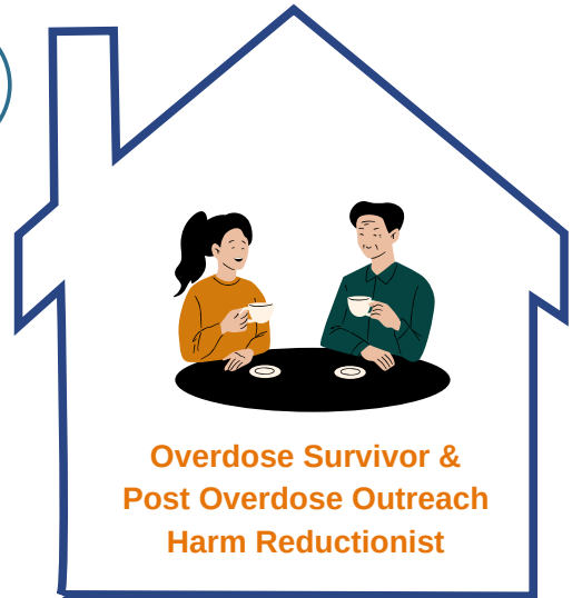
Overdose Survivor & Post Overdose Outreach Harm Reductionist